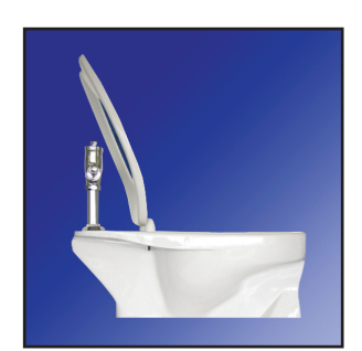
Self-Sustaining Check Hinge -External self-sustaining check hinge seat in any raised position up to 11 degrees beyond vertical